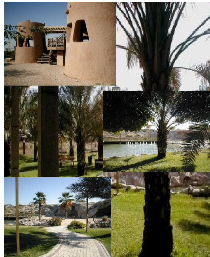
Gala Dinner is sponsored by Gulf Medical Co. Systems

The Al Ma'ather Cave Park is part of the land donated to the King Faisal Specialist Hospital and Research Center. Historically it was a place of recreation near Riyadh used for picnics and social gatherings. King Abdulaziz used to hold important meetings there. About a decade ago it was developed as a part of the hospital landscaping and is utilized by the hospital staff and their dependents. It also hosts several social events throughout the year. It is believed that the old Bedouins used it as a place to stay when they came for meetings or to visit.